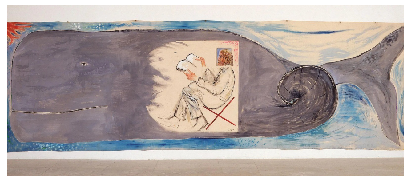
Love at First Sight: The Vera, Silvia and Arturo Schwarz Collection of Israeli Art, The Israel Museum, Jerusalem, 2001