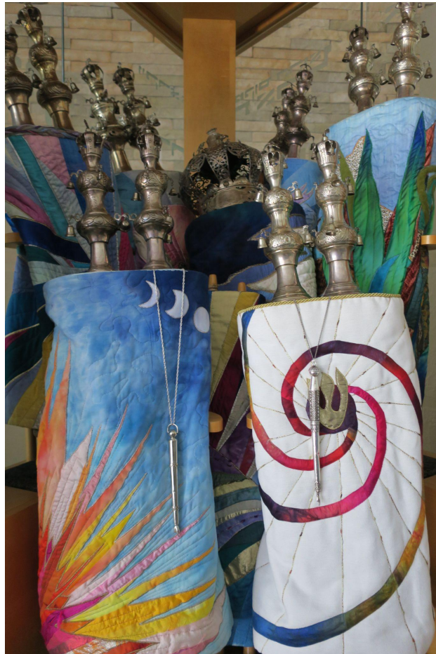
Quilted Torah mantles, Amanda Ford, Maryland, USA